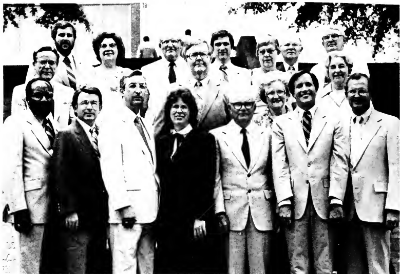
Delegates To General Conference